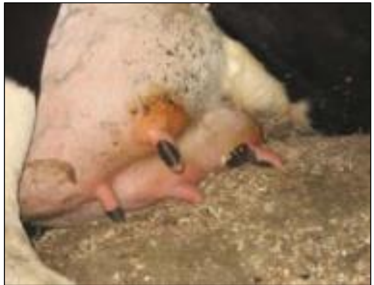
Pictured above is a down cow with Klebsiella mastitis. Klebsiella is a type of bacteria that can cause severe clinical mastitis in dairy cows.

Research performed at the Iowa State University dairy farm demonstrated that cows given a commercially available Klebsiella vaccine (Vaxxon SRP Klebsiella ) had 76% fewer cases of Klebsiella mastitis, and 55% fewer cases of mastitis caused by any coliform bacteria than